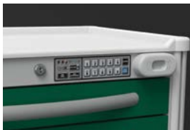
PROXIMITY LOCKING SYSTEM (OPTIONAL WIFI AVAILABLE)