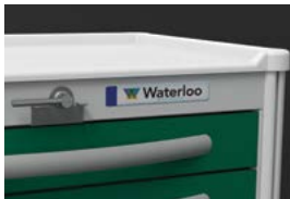
LEVER/BREAKAWAY LOCKING SYSTEM