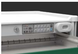
DUAL ACCESS CONTROLLED SUBSTANCE DRAWER