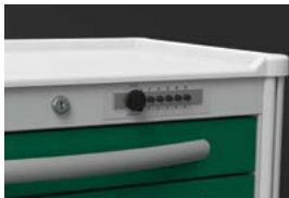
PUSH BUTTON COMBINATION LOCKING SYSTEM