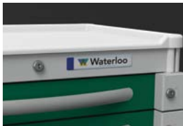
GATE LOCKING SYSTEM