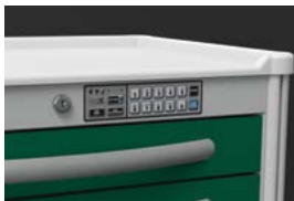
ELECTRONIC LOCKING SYSTEM (OPTIONAL WIFI AVAILABLE)