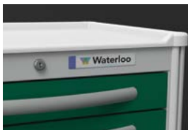
KEY LOCKING SYSTEM