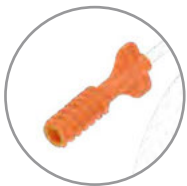
MICROSTREAM™ TYPE LUER