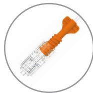
MICROSTREAM™ TYPE LUER + M/M ADAPTER